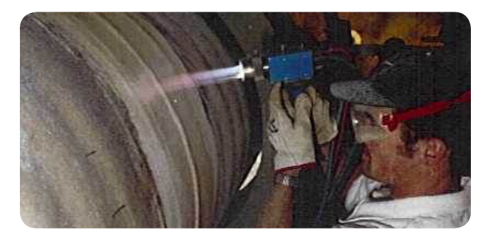
Flame-spray System.

Hifax EP5 10/60 Bianco pellet is used by Pipeline Induction Heat Limited to produce their PP tape-wrap field-joint coating.